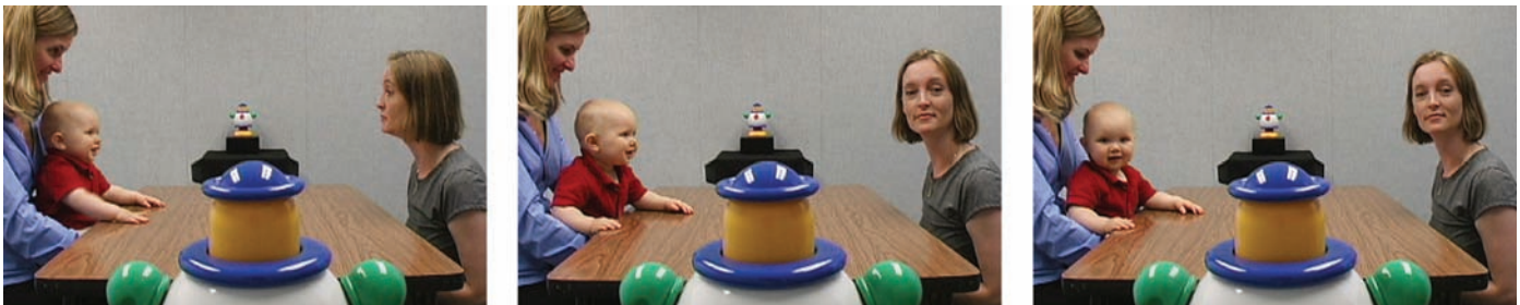
Fig. 2. Gaze following is a mechanism that brings adults and infants into perceptual contact with the same objects and events in the world, facilitating word learning and social communication. After interacting with an adult ( left ), a 12-month-old infant sees an adult look at one of two identical objects ( middle ) and immediately follows her gaze ( right ).

Shared attention. Social learning is facilitated when people share attention. Shared attention to the same object or event provides a common ground for communication and teaching. An early component of shared attention is gaze following (Fig. 2). Infants in the first half year of life look more often in the direction of an adult's head turn when peripheral targets are in the visual field (31). By 9 months of age, infants interacting with a responsive robot follow its head movements, and the timing and contingencies, not just the visual appearance of the robot, appear to be key (32). It is unclear, however, whether young infants are trying to look at what another is seeing or are simply tracking head movements. By 12 months, sensitivity to the direction and state of the eyes exists, not just sensitivity to the direction of head turning. If a person with eyes open turns to one of